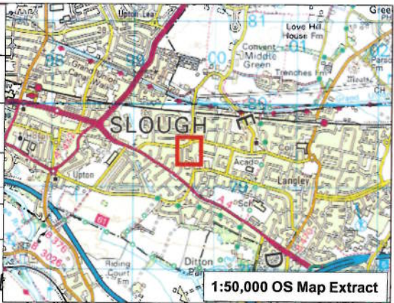
1:50,000 OS Map Extract